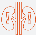
Kidney failure/ undergoing dialysis